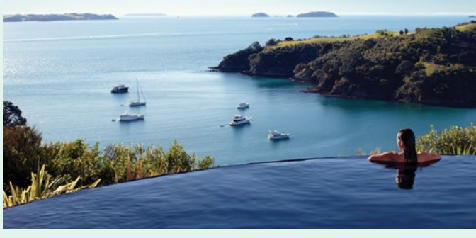
Delamore Lodge, Waiheke Island, Auckland's Hauraki Gulf

www.superyachtnewzealand.co.nz/destination